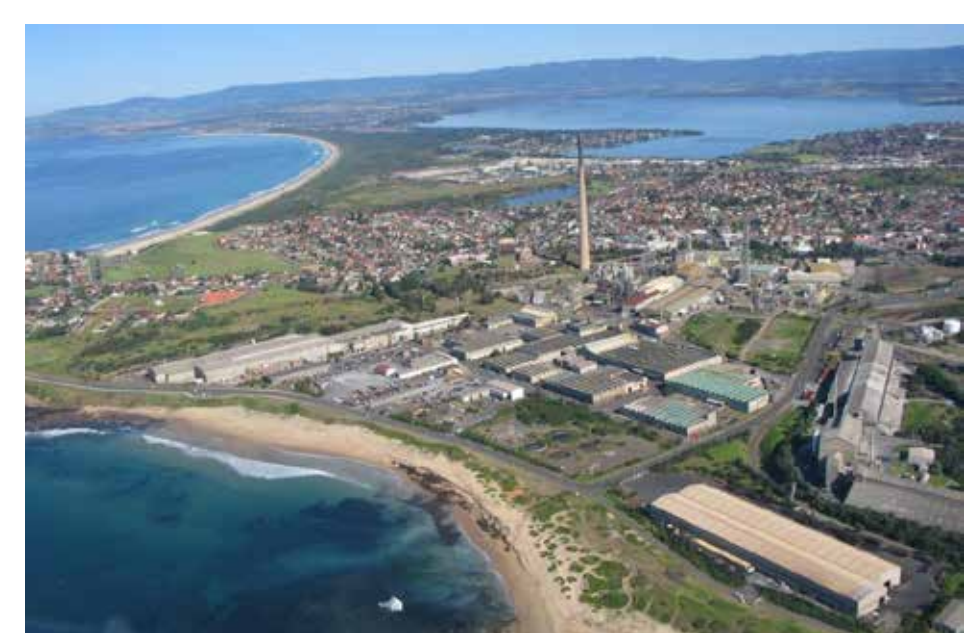
MM Kembla's Australian manufacturing facilities at Port Kembla.

MM Kembla manufacturing processes and quality systems are built upon 100 years of experience in manufacturing copper tube. An intensive ISO9001 certified quality control system is applied to all MM Kembla products. MM Kembla also has a variety of third party accreditations to Australian, New Zealand, British/ European and American standards.